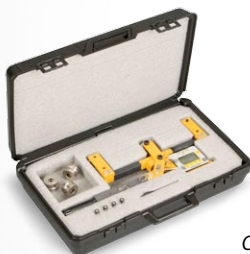
Carrying case available.

Operating range: -4°F to 140°F (-20°C to 60°C)