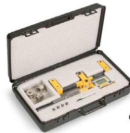
Carrying case included

Dillon also manufactures highly accurate tensiometers, mechanical dynamometers and crane scales.