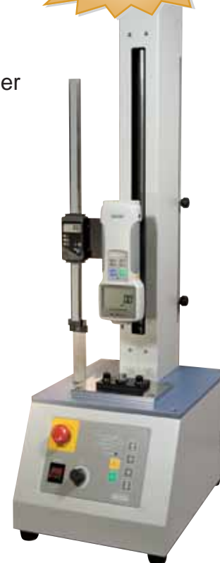
MX-275S with Digital Distance Meter and Timer Force gauges and attachments are sold separately.

Specifications subject to change without notice.